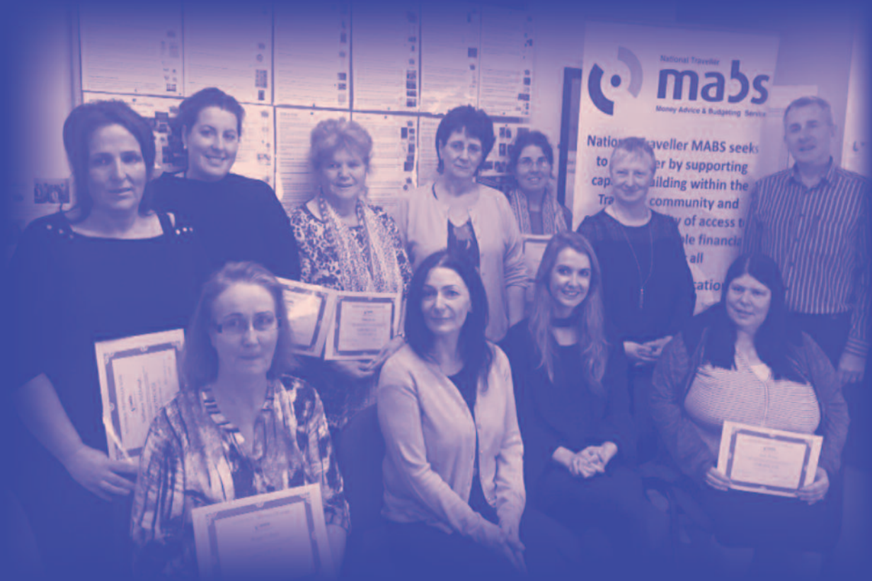
Meath Traveller Primary Health Care workers completed money management training with local MABS